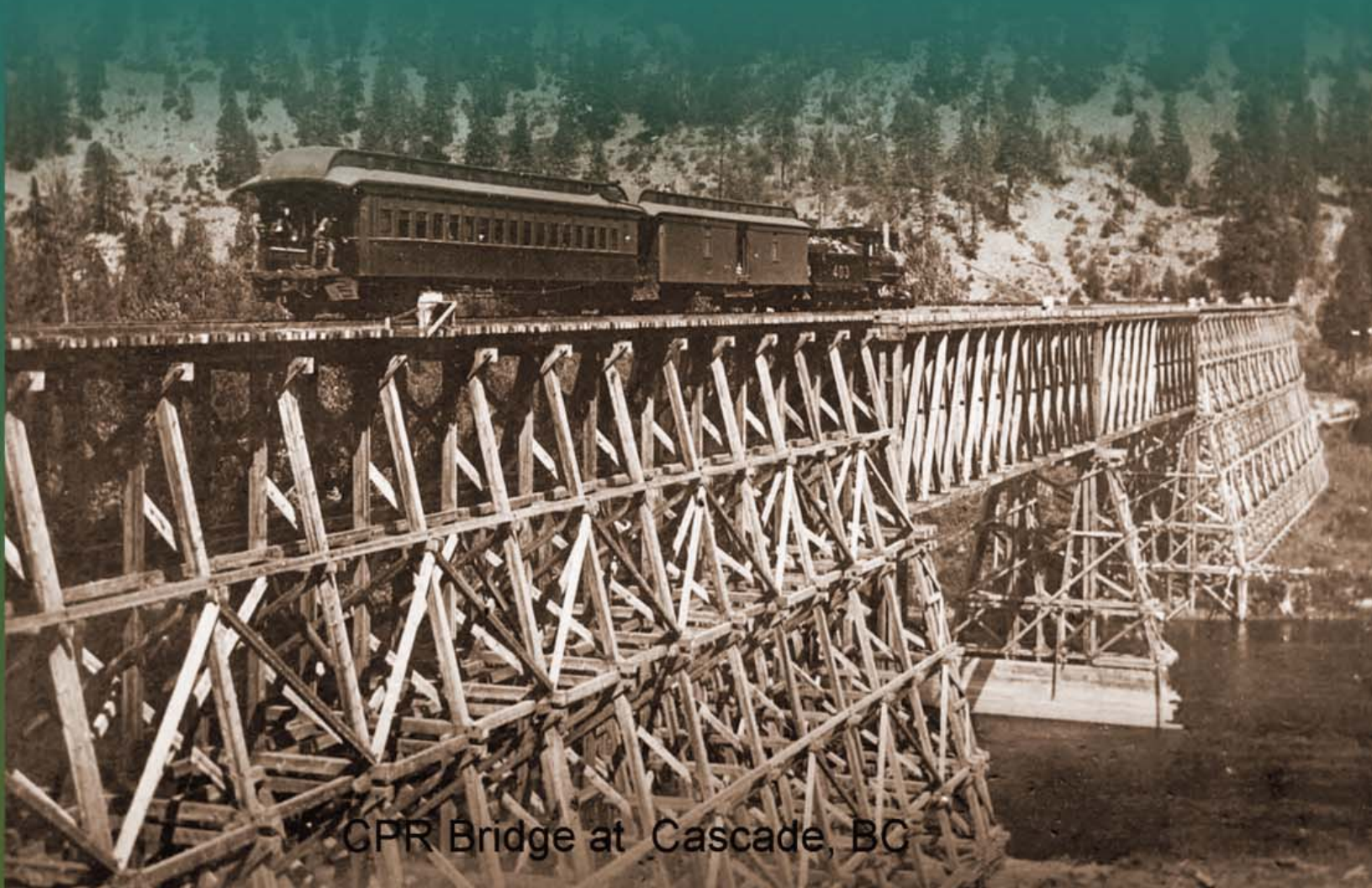
GPR Bridge at Cascade, BC